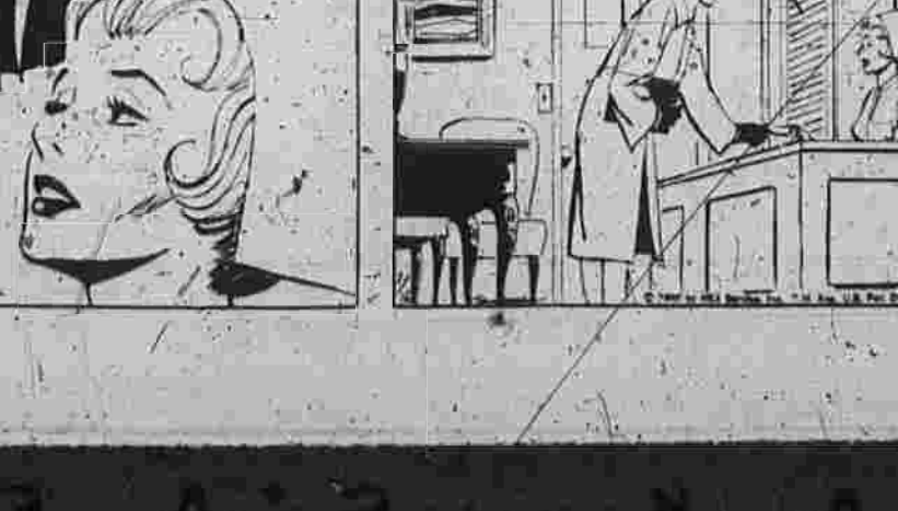
WATER'S RISING BY PETE HOFFMAN