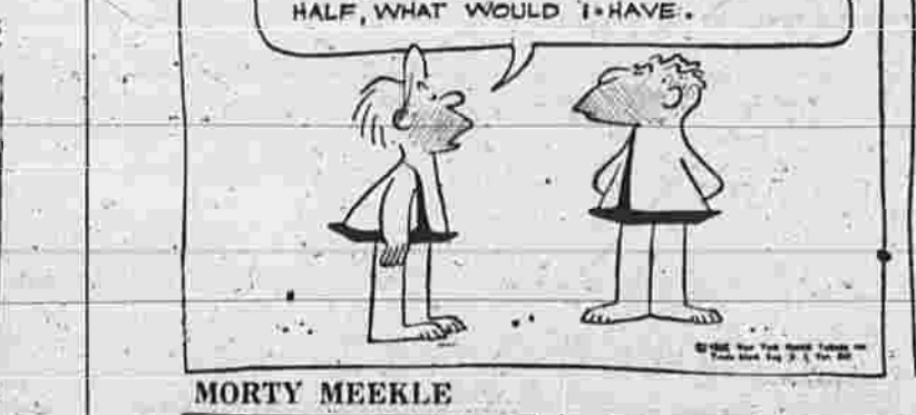
B. C. BY JOHNNY HART