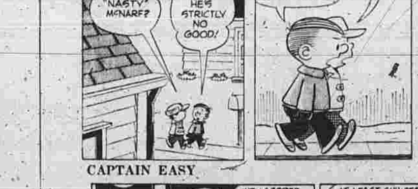
MORTY MEKLE BY DICK CAVALLI